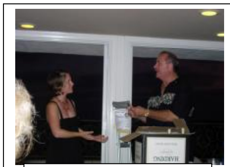
The Presidential change