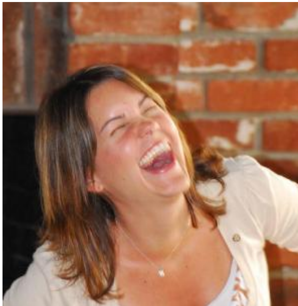
A picture of a winner